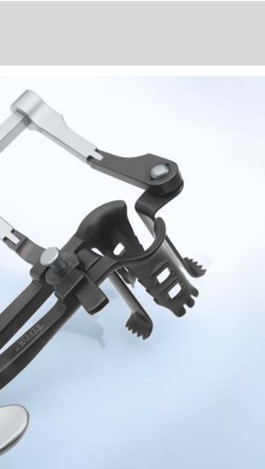
A) Lumbar minimally invasive approach for discectomy